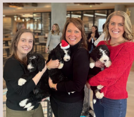
Top: Bridgewater Bank team members gather to celebrate Twin Cities Pride.