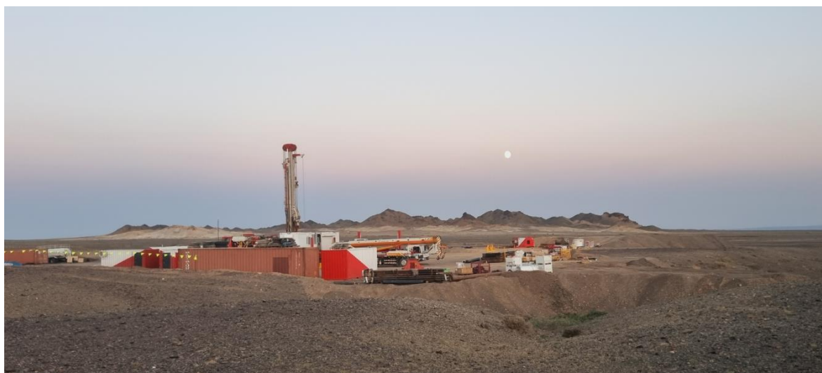
Figure 2: Major Drilling at Nomgon IX